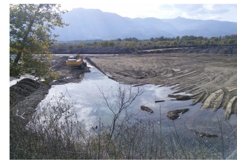
Implemented NBS-NWRM in Zilefto