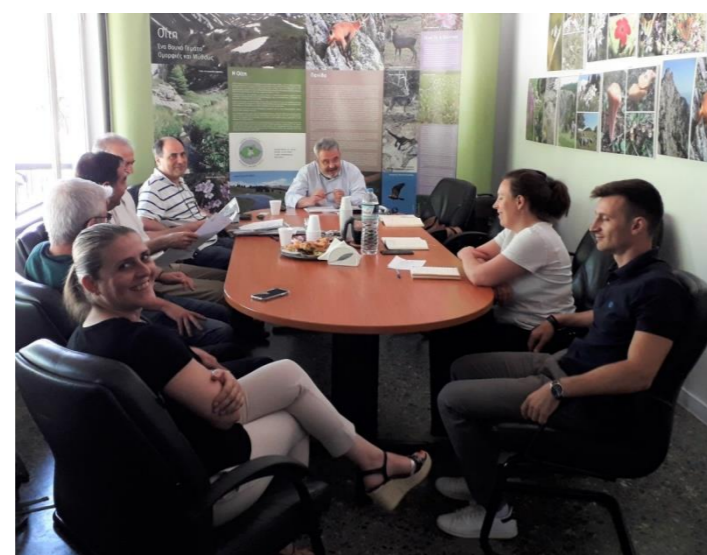
Meeting with local environmental agency for biodiversity