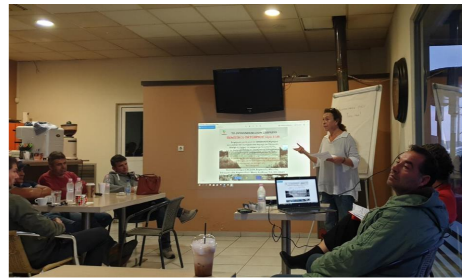
Focus Group Discussion on perception of NBS