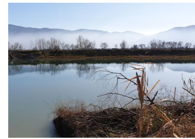
Implemented NBS-NWRM in Komma